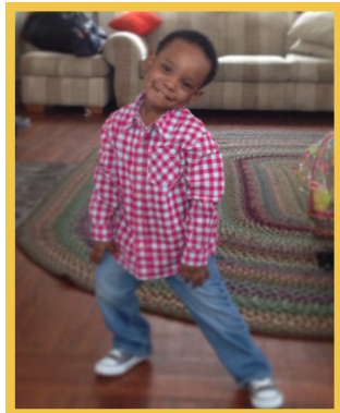
Providing Stable Housing